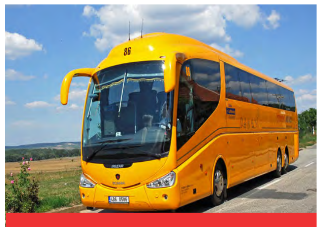
MOTORING & TRANSPORT

Economic activity in modern-day South Africa has been centred on mining activities, their ancillary services and supplies. For this reason we developed products that deliver in performance under extreme conditions. Our extreme pressure greases, hydraulic fluids, engine oils etc. are ideal for any mining job in South Africa. Our products are Ideal for use in Gold, Diamond, Platinum or Coal mining operations.